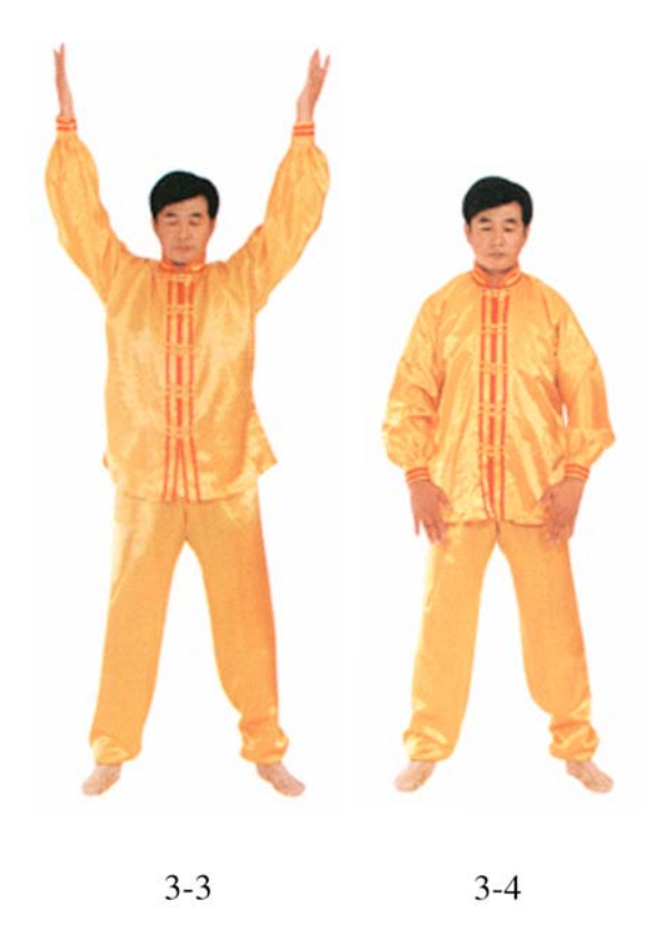
Double Up-and-Down Arm Movement ( Shuangshou Chong'guan )<sup>57</sup> – At the ninth singular-arm movement, the left arm (females, the right arm) stays up and waits while the other arm is brought up. Both hands are pointing upward (Fig. 3-3). Next, move both arms downward at the same time (Fig. 3-4). Keep the palms facing the body at a distance of 10 cm (4 inches). One up-and-down movement of the arms is counted as one time. Repeat nine times.