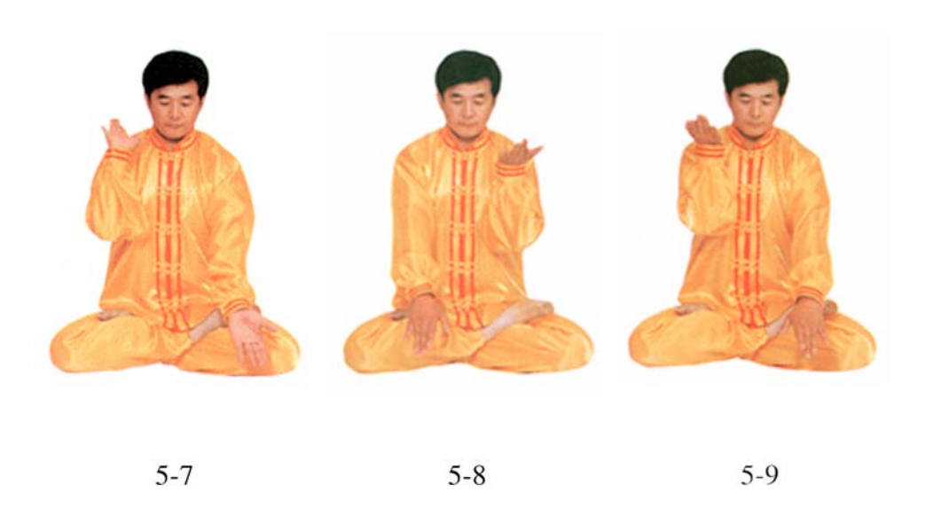
Fourth Mudra – This is the same mudra as shown above, but with the hands in opposite positions. The left hand for males (right for females) moves on the inside, and the right hand (left for females) moves on the outside. The movements just switch the left with the right hand. The hands are in opposite positions (Fig. 5-9). When doing all four mudras the movements are continuous, without interruption.

Third Mudra – Straighten the right wrist for males (left for females) with the palm facing the body. After the right (or left) hand moves across in front of the chest, turn the palm to face down and move it down to the lower front where the shin is located. Keep the arm straight. Males, turn the left wrist (females, the right) while moving it up and passing the right hand with the palm facing the body. At the same time, move the palm toward the left (females, the right) shoulder. When the hand has reached its position, the palm faces up and the fingers point forward (Fig. 5-8).