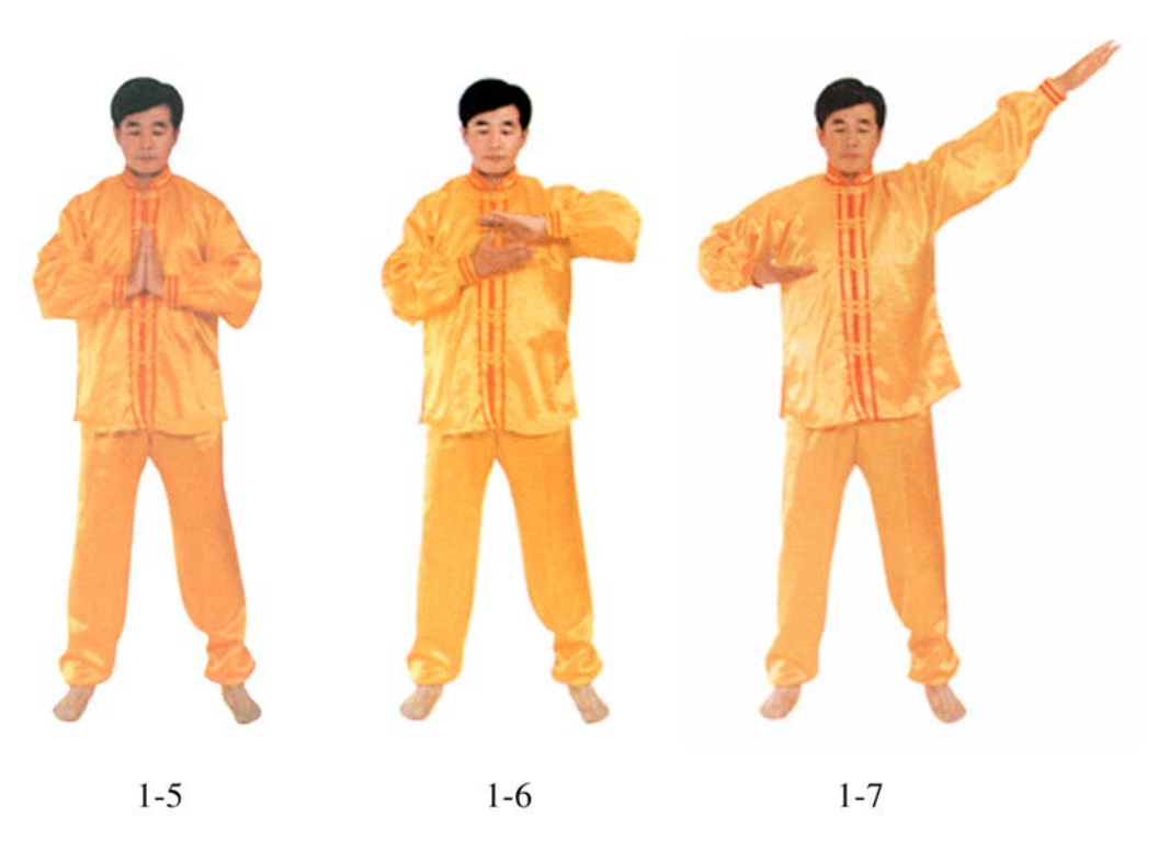
Hands Pointing to Heaven and Earth ( Zhangzhi Qiankun )<sup>34</sup> – Starting from the posture of Heshi , separate the hands 2-3 cm (1 inch) and start to turn them. Males turn the left hand (females, the right hand) towards the chest and turn the other hand outwards, so that the left hand is on top and the right hand is on the bottom (for females, the opposite). Both hands should make a straight line with the forearms (Fig. 1-6). Next, extend the top forearm diagonally upward with the palm facing down, until the hand reaches the level of the head. Keep the other hand at the chest with the palm facing up. As the top arm extends, stretch the entire body gradually, push the head upward, and press the feet downward. Stretch the top arm upward in the upper left direction (females, the right direction), while the arm that is in front of the chest stretches outward along with the raised arm (Fig. 1-7). Stretch for about 2 to 3 seconds, then relax the entire body abruptly.

Pressing the Hands Together in Front of the Chest ( Shuangshou Heshi )<sup>32</sup> – When reaching the lower abdominal area, without pausing, lift the hands up to the chest and press them together ( Heshi ) (Fig. 1-5). When doing Heshi , press both the fingers and the heels of the palms against each other, keeping a hollow space between the palms. Hold the elbows up, with the forearms forming a straight line. (Keep hands in the Lotus Palm position, <sup>33</sup> except when putting hands together ( Heshi ) or conjoining them ( Jieyin ); the same applies to the following exercises.)