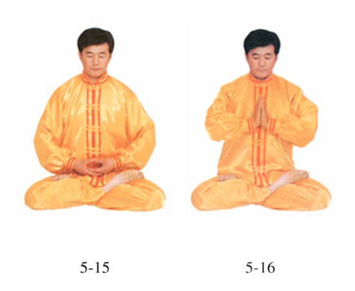
Ending Position – Press the hands together in front of the chest in Heshi (Fig. 5-16). Come out of stillness and the lotus position.

Serene Cultivation – From the last position, draw a semicircle downward with the upper hand (Fig. 5-15), bringing the hand down to the lower abdominal area. Conjoin the hands in Jieyin and start the serene cultivation. Stay in stillness. The longer the better.